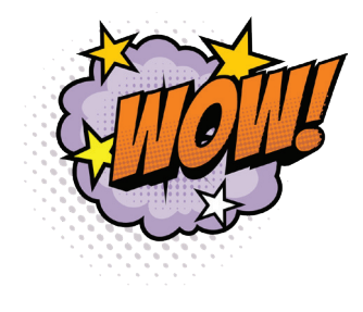
The Friends had another successful Big Book Sale during Downtown Sidewalk Sales.

LAST TUESDAY OF THE MONTH • 4:00PM SEPTEMBER 27, OCTOBER 25, & NOVEMBER 29